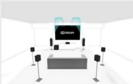
7.1.2 Perspective Detail

This refers to how many overhead or Dolby Atmos enabled speakers you can use in your Dolby Atmos capable setup.