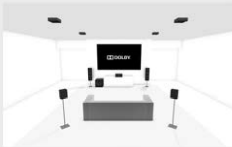
5.1.4 Perspective Detail

This refers to how many overhead or Dolby Atmos enabled speakers you can use in your Dolby Atmos capable setup.