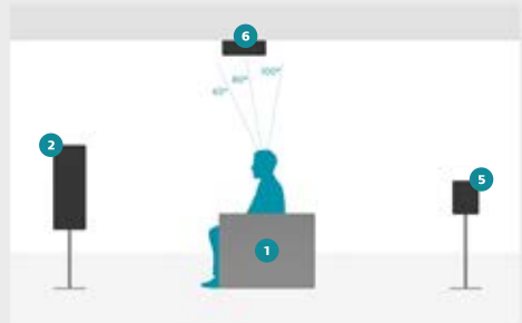
5.1.2 Ceiling Speaker Placement Detail