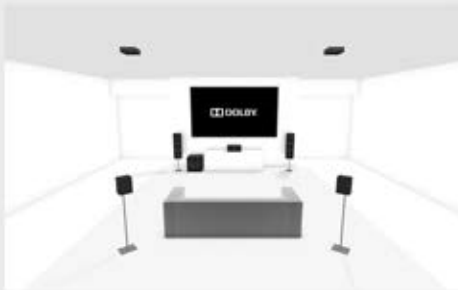
5.1.2 Perspective Detail

This refers to how many overhead or Dolby Atmos enabled speakers you can use in your Dolby Atmos capable setup.